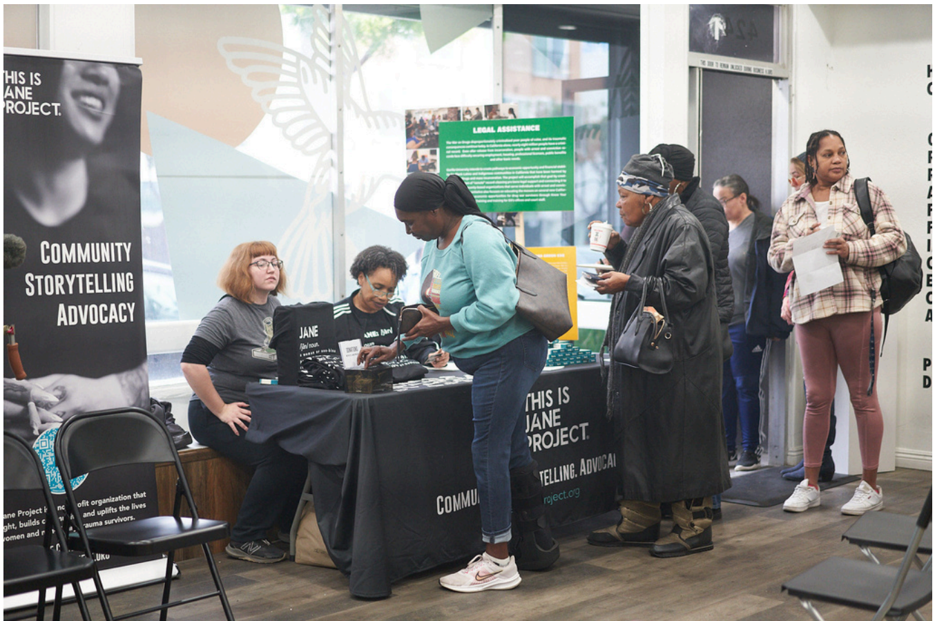
Los Angeles - Survivors without Access Event

There are Janes across the country that lack access to healing alternatives and our wish for 2025 is that we continue to expand into new markets to bring our trauma-informed programming to more Janes. How do we want to achieve that? Through collaborative sponsorships and partnerships with like-minded organizations. With much-needed sponsorship dollars, we can serve more Janes who are confronting, managing, and healing from trauma. We have merely scratched the surface of what we can accomplish together. Join us in this fight, and help us Help Jane Heal with a tax-deductible donation today!